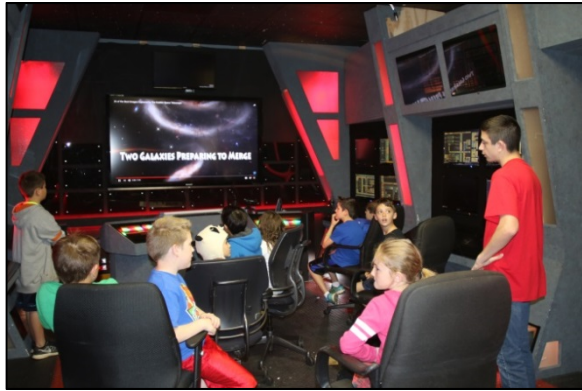
Learning to fly a Spaceship in our Starship Bridge room.