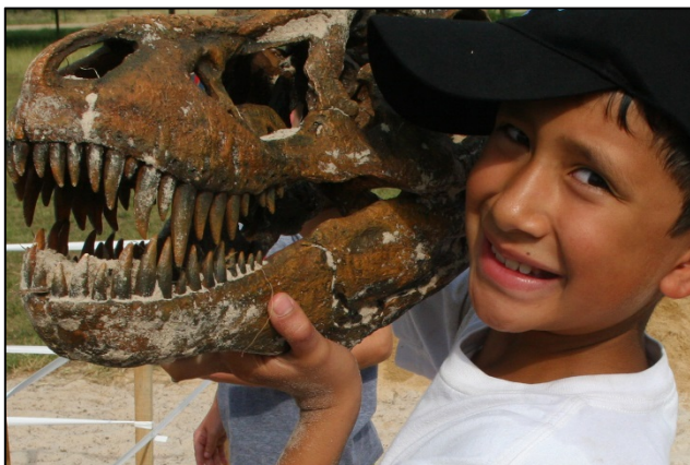
Dig up a 32 foot Allosaurus skeleton – and her kids - in the dino dig!

Spring STEM Adventure Camp is open to children ages 5-12. We offer hands-on science experiences and lots of fun too!