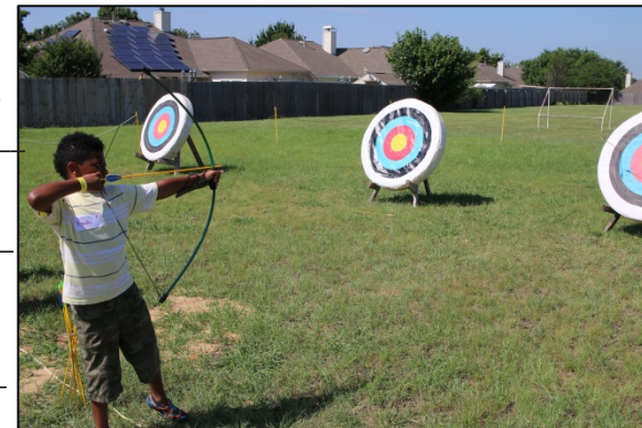
On target for STEM fun in 2019!