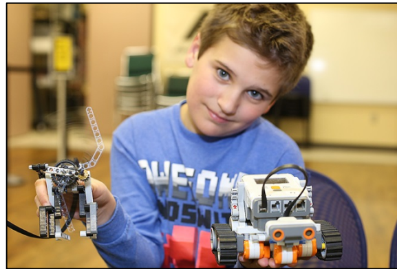
Building a robot!