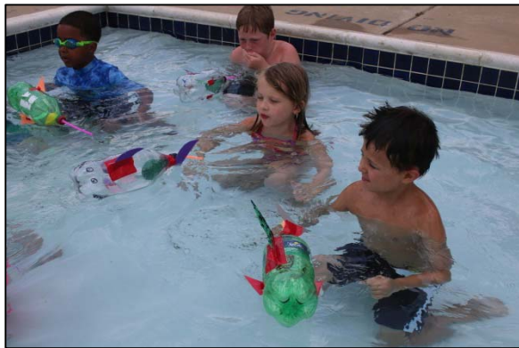
We even do science experiments in the pool at swim time!