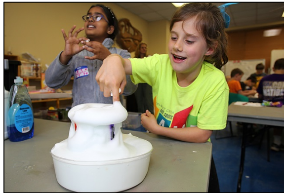
Sometimes Science boils over in the Blue Room!