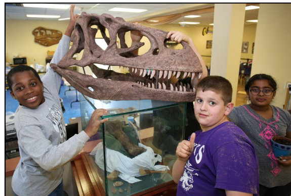
Bringing Geology and Paleontology to life!