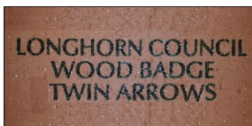
Image of a sample final brick