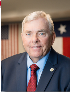
HONORING HENRY WILSON MAYOR OF HURST, TEXAS